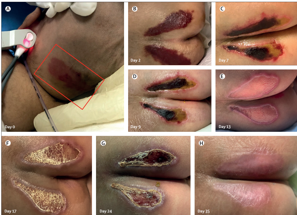
Figure 2: Skin manifestations in the patient

(A) Erythema (inside the box) over the occipital scalp region, noted at initial presentation. (B–H) Evolution of skin lesions over the buttocks during the course of illness.