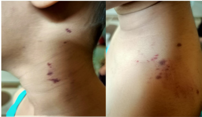
Figure 1 Clinical image showing petechiae, purpura on the left side of the neck and over the left shoulder.

aetiology. Antinuclear antibody (ANA) levels, thyroid function tests done were within normal limits. Anti-HCV-Ab to hepatitis C virus was non-reactive. Direct Coombs' test was negative. Immunoglobulin profile also showed total IgA, IgM, IgE and IgG were within normal limits. With a history of SARS-CoV-2, it was established that she was suffering from ITP secondary to SARS-CoV-2. Intravenous immunoglobulin (IVIg) was administered at 1 g/kg of body weight of the child. She was also started on oral prednisolone (2 mg/kg/day) which was later increased to 4 mg/kg/day. However, there was no response as the platelet count remained below <10\,000/\text{mm}^3 with new petechiae appearing along with oral mucosal bleed. She, again, underwent platelet transfusion. In addition, to ongoing steroid, she was started on thrombopoietin (TPO) receptor agonist. A single dose of inj. romiplostim was given once (1 \mu\text{g}/\text{kg} ) and tab. eltrombopag (25 mg/day) was also started. Two weeks after initiation of TPO receptor agonist, her platelet counts had improved to 24\,000/\text{mm}^3 . On subsequent blood investigations, here platelets had further increased to 157\,000/\text{mm}^3 . After 4 weeks of hospital stay, she was discharged home on prednisolone (tapering dose) and eltrombopag.