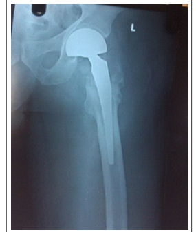
Figure 3: The final radiograph of the same patient after revision surgery.

canal has lead to an increased incidence as well as new patterns of periprosthetic femur fractures. These fractures can be adequately managed without significantly increasing the patient morbidity, mortality and revision surgery [4].