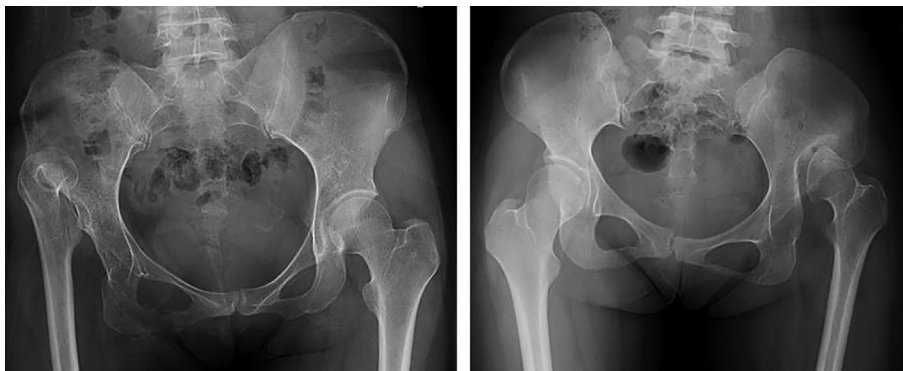
Fig 1. (a) Absence of false acetabulum, there was no sign of osteosclerosis; (b) false acetabulum formation, the femoral head reached the lateral margin of ilium wing, accompanied with the formation of high-density osteosclerotic zone and osteophyte.

The osteotomy position was planned to be adjacent enough to the end of the proximal sleeve, approximately corresponding to 1–2 cm beneath the lesser trochanter. Prophylactic cerclage wires were placed both proximally and distally around the fragment of the planned osteotomy. Also, a longitudinal line along the femoral diaphysis was marked by electrocautery prior to osteotomy to determine the rotation. After removing the trial, a transverse osteotomy was performed, by resection of a length of the femur below the lesser trochanter. The length of the removed bone stock was based on the distance we measured before, leaving a scope of 1–1.5 cm with the surgeon's discretion. After completion of osteotomy, a final preparation of the femur was undertaken until optimal cortical contact was achieved. Then, the trial reduction was performed again. If impossible, additional bone was incrementally resected at