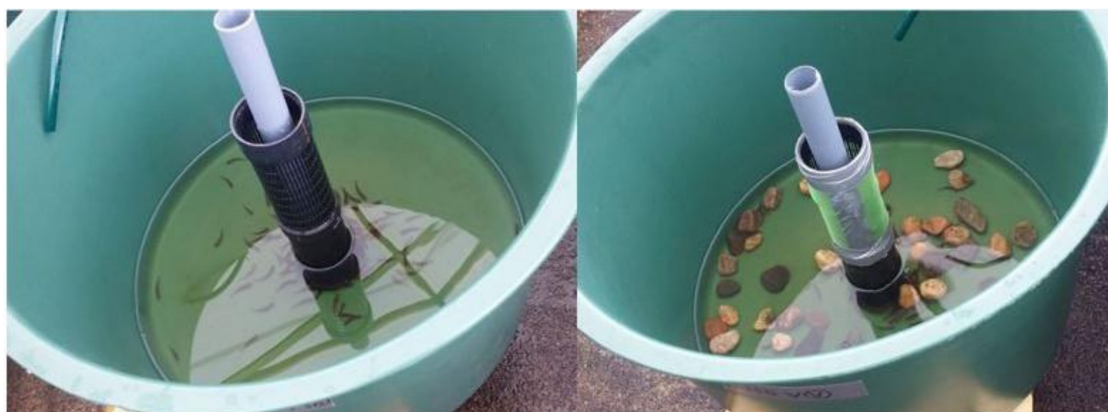
Figure 2. Standard and enriched tanks used in the experimental bacterial exposures. Replicated tanks with no stones (left panel), few stones (6 stones) or many stones (60 stones, right panel) were used. In addition, stones were either clean, unconditioned or conditioned in lake water before the experiment. Each tank (0.4 m 2 ) had 100 fish (either trout or salmon) and 60 l of water (16.5–18.9 °C).

Fish of both species (mean length \pm SE: 40.1 \pm 0.09 mm (trout), 41.7 \pm 0.08 mm (salmon)) were transferred to 50 tanks (0.4 m 2 ) for the bacterial exposure, each tank with 60 L of water and 100 fish (either salmon or trout). Five different stone treatments were used for each species: tanks without stones, tanks with few stones (6 stones, 40–60 mm in diameter each) or with many stones (~60 stones of the same size, total volume 5 l, distributed randomly to the tank) that were either unconditioned or conditioned (Figure 2). Conditioning was done by keeping the stones in lake water (10–18 °C) in replicated rearing tanks for approximately seven weeks prior to the experiment. These tanks were separate from the housing tanks of the experimental fish (see above) to prevent possible familiarization effects of the fish to their home tanks. Unconditioned stones from the same lot had not been in the lake water before the experiment and were washed with tap water and sprayed with alcohol before the experiment. Each treatment combination had four replicate tanks (2 species \times 5 treatments \times 4 replicates = 40 tanks) and additionally one unexposed control tank for each combination (2 species \times 5 treatments \times 1 tank = 10 tanks). Stones and fish were placed into experimental tanks with constant water inflow 24 h before the exposure to allow the fish to recover from the transfer.