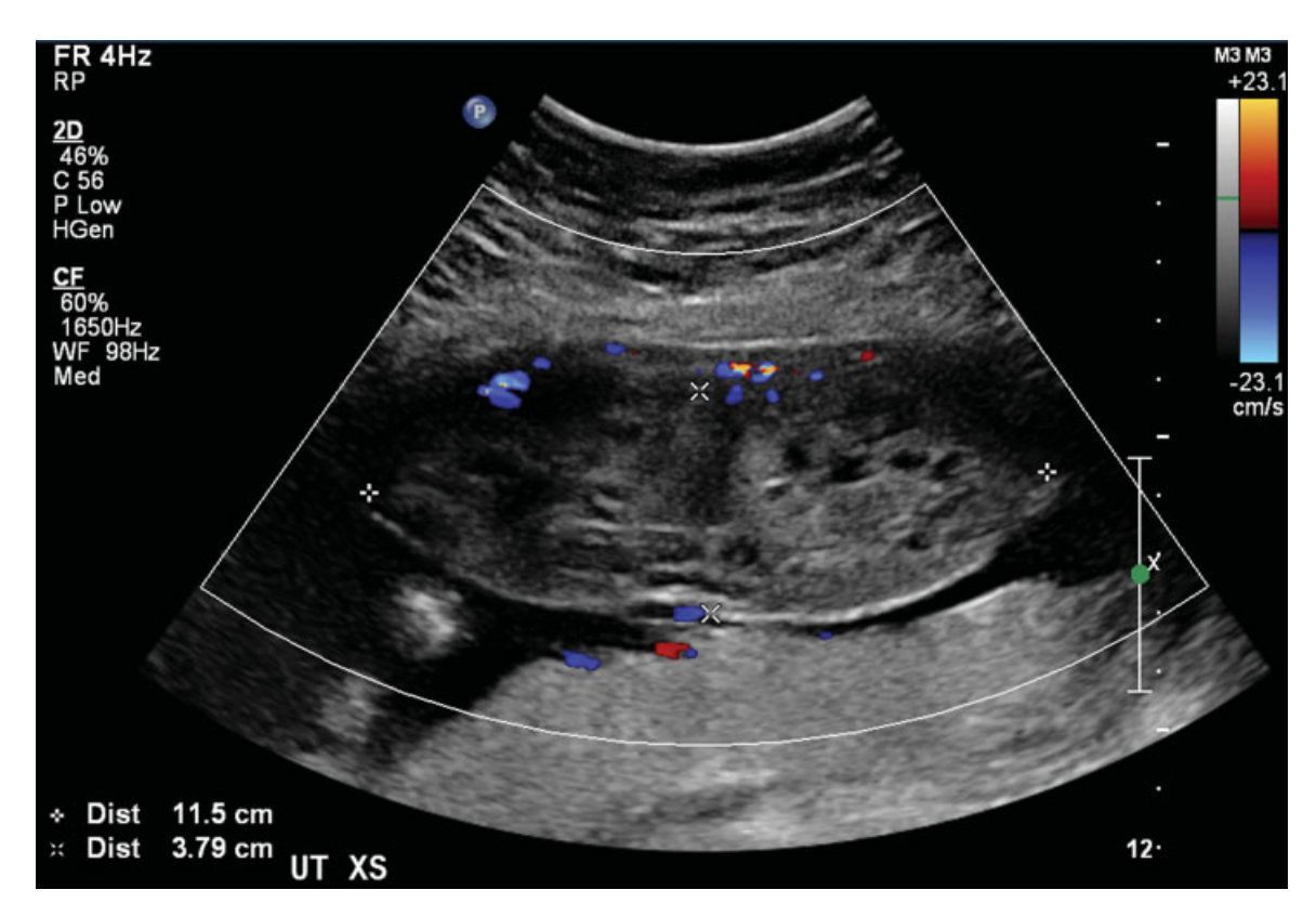
Fig. 1 Dizygotic pregnancy with large complete hydatidiform molar tissue and normal placenta.