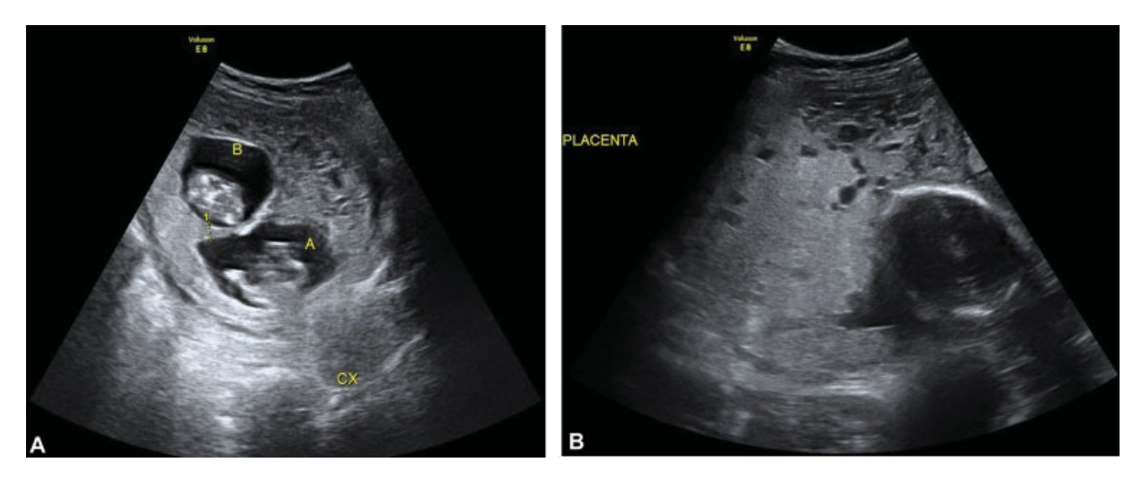
Fig. 4 Trizygotic pregnancy at (A) 11 weeks and 5 days with complete hydatidiform molar tissue and at (B) 24 weeks with the head of twin B and complete hydatidiform molar tissue.

complete mole have been reported (► Table 4 ).<sup>5,9,10,14–16</sup> Of the 16 cases, 87.5% have been pregnancies conceived with ovulation induction medications. The clinical course of these pregnancies shows that vaginal bleeding is very common, presenting in 59% of the cases reported to date.