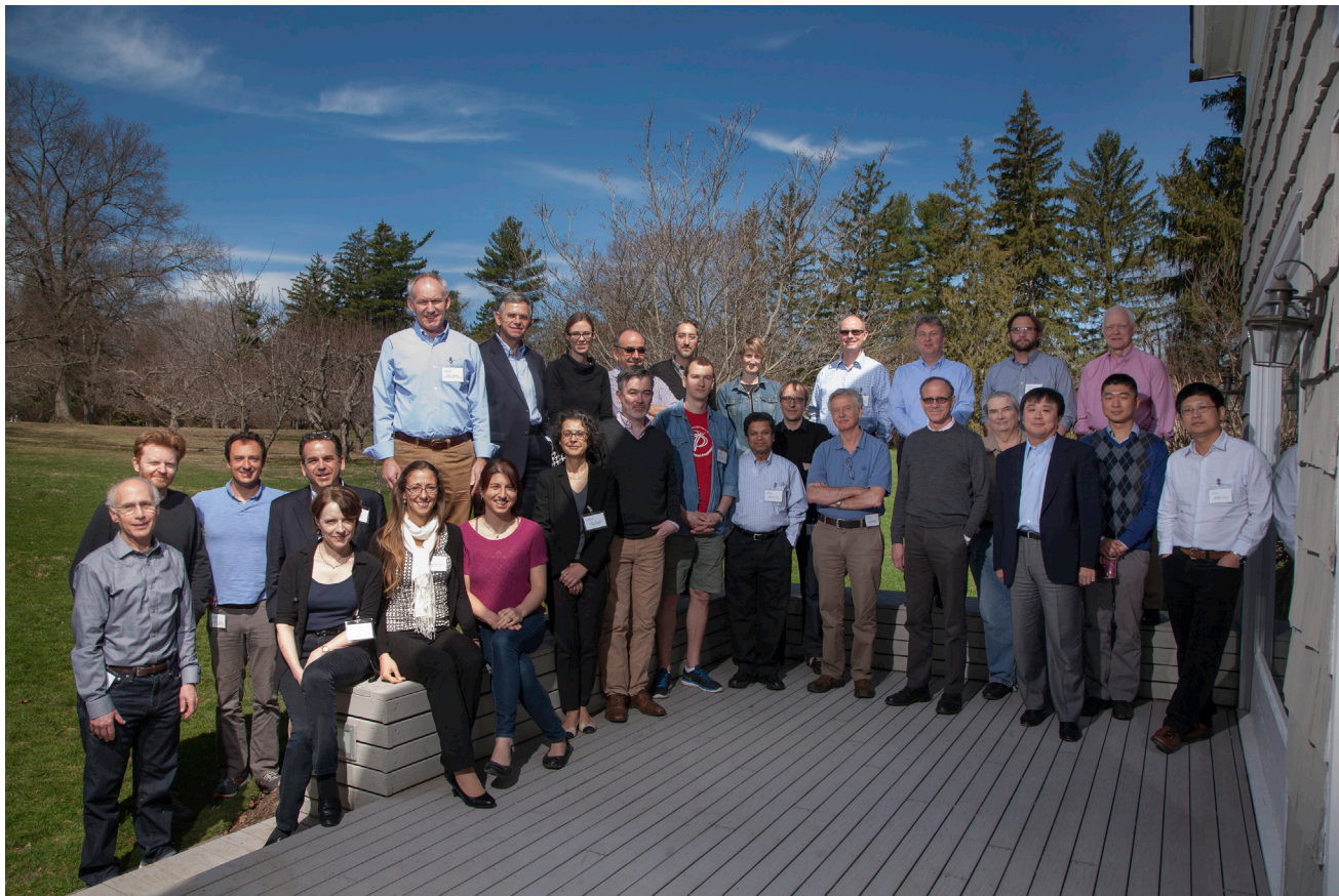
Figure 2. Banbury Meeting Attendees

for naive human pluripotency, ultimately yielding an improved combination of five kinase inhibitors (5i/L/FA) that induces and maintains OCT4 distal enhancer activity when applied directly to conventional hESCs (Theunissen et al., 2014). Using these optimized conditions, his group demonstrated direct conversion of primed to naive ESCs in the absence of transgenes and isolation of novel hESCs from human blastocysts. They noted, however, that naive hESCs showed upregulated XIST and evidence of X inactivation, raising the possibility that X inactivation in naive stem cells in mouse and human may be different. Critically, transplantation of GFP-positive human naive hESCs into mouse blastocysts yielded no GFP-positive E10.5 embryos, either by their original method ( n = 860 embryos) or by published methods (Gafni et al., 2013) ( n = 436+ embryos). PCR for human mitochondria is a more sensitive assay, identifying even the presence of 1/10,000 human cells, but this also failed to detect mouse-human chimerism. Although the generation of interspecies chimeras by injection of human ESCs into mouse morulae was proposed as a stringent assay for naive human pluripotency (Gafni et al., 2013), the assay may be too inefficient for use as a routine