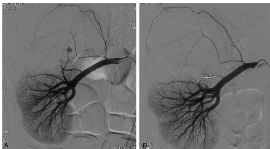
Figure 2. Renal angiography of RAP before and after TAE. (A) Angiography showed a pseudoaneurysm after LPN. (B) Angiography after coil embolization revealed the disappearance of the RAP. LPN = laparoscopic partial nephrectomy, RAP = renal arterial pseudoaneurysm, TAE = transarterial embolization.

decreasing after operation. The gross hematuria disappeared completely, and flank pain was relieved gradually. Clinical success was attained in 26 cases (96.3%) after the first TAE. Gross hematuria in 1 patient was not relieved after embolization and a second embolotherapy was performed on the third postoperative day. Subsequently, there was no recurrent hematuria or progression of hematoma identified in the patient. None of the remaining patients required additional endovascular or surgical intervention due to recurrent hemorrhagic episodes during follow-up period.