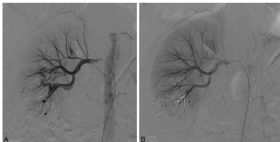
Figure 3. Renal angiography of RAVF and RAP before and after TAE. (A) Angiography showed early filling of the renal vein branches and 2 pseudoaneurysms after RB. (B) Following coil embolization the RAVF and RAP no longer existed. RAP = renal arterial pseudoaneurysm, RAVF = renal arteriovenous fistula, RB = renal biopsy, TAE = transarterial embolization.

In recent years, with the increase of minimally invasive and complex renal surgeries and procedures such as RB, LPN, PCNL, and PN, the incidence of renal hemorrhage gradually increased. [1] It is a life-threatening complication and usually related to injury of anterior and/or posterior segmental arteries, interlobular arteries, or arcuate arteries. [1] The main reason for bleeding in our series was renal vasculature damage secondary to RB (14/27, 51.9%) and LPN (7/27, 25.9%). Although route of RB was carefully selected in areas devoid of blood vessels, mostly in the inferior pole of the kidney under the ultrasound guidance, distal branches of renal artery may still be damaged and result in hematuria, hemorrhage, and perirenal hematoma. [1] The