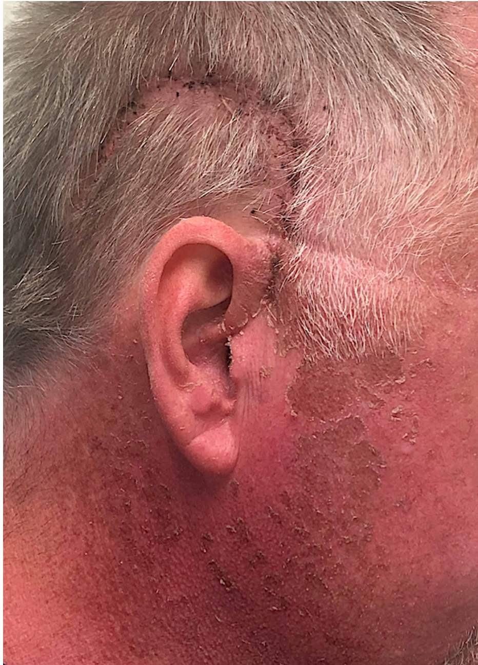
FIGURE 3: Image of the right side of the patient's head and neck taken at his one-week follow-up visit demonstrating a healing surgical incision as well as skin erythema, blistering, and peeling. Of note, the worst of the skin erythema and the blistering and peeling were only seen on the right side of his head/neck, which were the areas of his body that had been exposed to surgical lights in the operating room.