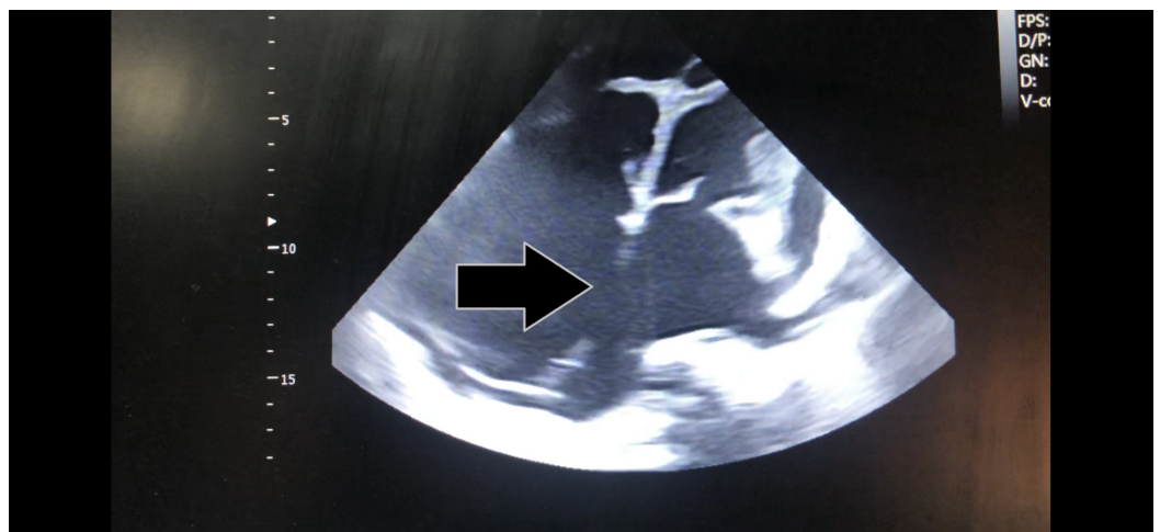
FIGURE 2: Large secundum atrial septal defect with a dilated right heart (black arrow)