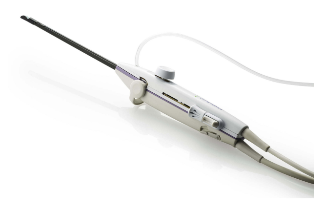
Figure 1 The Sonata treatment device, combining an intrauterine sonography probe with a radiofrequency ablation handpiece into a single integrated handpiece.

Premenopausal women between ages 25–50 with symptomatic uterine fibroids associated with heavy