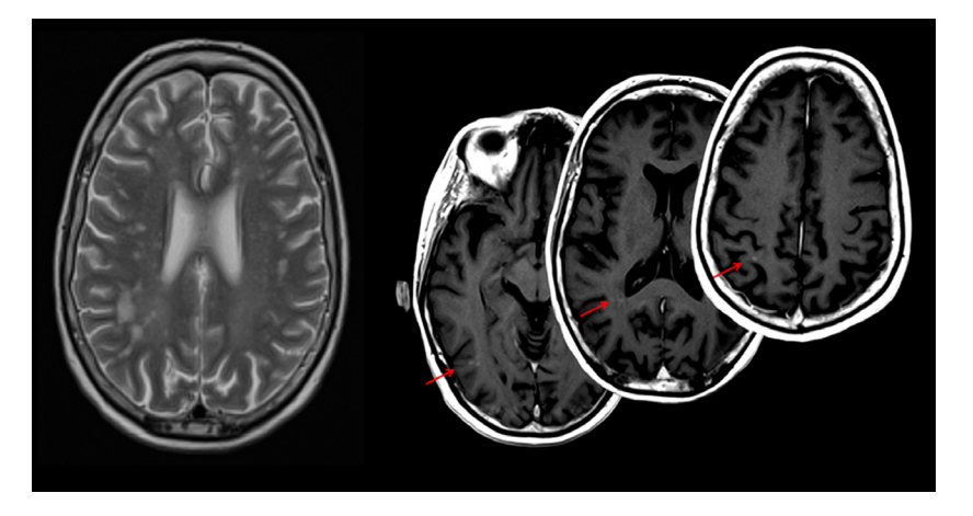
Figure 1. Axial T2-weighted (left) and postcontrast T1-weighted (right) MRI showing lesions consistent with the diagnosis of CNS involvement in systemic lupus erythematosus. Contrast-enhancing lesions (right) indicate disease activity at the time of acquisition. MRI, magnetic resonance imaging; CNS, central nervous system.

successfully treated with antibiotics, ribavirin caused agranulocytosis which was effectively reversed by granulocyte colony-stimulating factor.