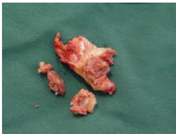
Figure 4. Excised tumor

MRI of wrist reported a relatively well-defined heterosignal mass lesion in the scaphoid bone, which was surrounded by edema in adjacent soft tissues with central signal void foci, which could be calcification, hemosiderin or flow void vascular structures and no evidence of fluid-fluid level. Chest X-ray and blood tests were normal. The patient underwent a biopsy through volar approach and specimen sent to histology revealing osteoblastoma. Once again her parents refused further operation at that hospital. Four weeks later the patient was admitted to our center. This time the pain was more intense and the wrist was swollen and stiff and there was a longitudinal scar on volar radial side of the wrist. The tumor was palpable on volar and dorsal of the wrist radial side. After consultation with parents, we opened the joint through volar approach with incorporating the scar of previous incision. The anterior capsule was invaded by red tan tumor of scaphoid but other carpal bones were unaffected. A 2×2.5×2 cm tumor along the affected soft tissue was removed (Figure 4).