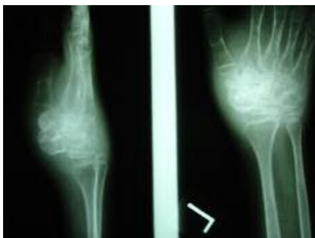
Figure 2. Preoperative X-ray two years after first X-ray

swell and pain became worse and finally two years later she was referred and admitted to an orthopaedic surgery unit in a university hospital where a complete work up was done. At this time, left wrist was swollen, there was a tumor with hard consistency on dorsal and wrist palmar especially on radial side with mild tenderness. The wrist was stiff with minimal motion range and grip power was decreased. Physical examination otherwise was normal. New X-ray revealed marked osteopenia of the wrist and adjacent bones and an osteolytic expansile lesion with opacities in its matrix in the scaphoid area (Figure 2).