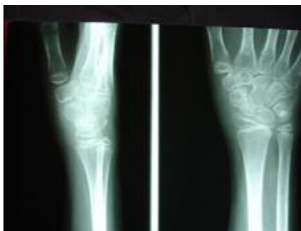
Figure 1. The first X-ray, two years before surgery

general practitioner took an X-ray from her left wrist and referred her to an orthopaedic surgeon because a lytic lesion was in her carpal scaphoid bone (Figure 1). At that time, the patient was advised for a complete work up but her parents refused further investigation. In spite of constant pain, the patient did not take any pain killer or anti inflammatory agent to subside the pain. Gradually the wrist started to