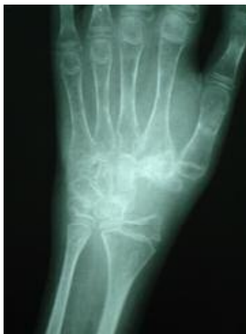
Figure 7. Anteroposterior X-ray of the left wrist three months post surgery