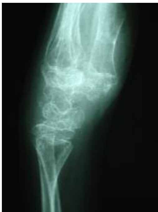
Figure 6. Lateral X-ray of the left wrist three months post surgery