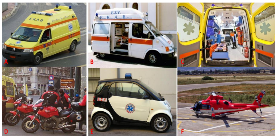
Figure 2. Types of EKAB ambulances. (A,B) Basic type of Ambulance; (C) Mobile Intensive Care Units; (D) Motorcycle ambulances; (E) Small vehicles for minor roads; (F) Helicopters.

Two types of ambulances are staffed by emergency personnel and are used for emergency transportations [8]. One type is the basic ambulance (Figure 2A,B) which has standard medical equipment for primary airway management procedures and oxygen delivery such as bag-mask ventilation, oxygen supplements, and a portable suction. Furthermore, it is equipped with an automated external defibrillator (AED), first aid wound care supplies, intravenous access kits, and immobilisation equipment. All ambulances are crewed by EMTs. This type of ambulance is the most commonly used [8].