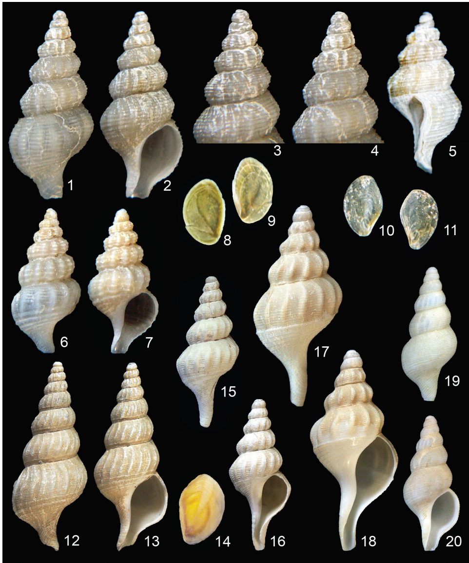
Figures 1–11. Jerrybuccinum kantori sp. n. 1–4 Holotype, 14.5 mm, Chile, northwest of the Bay of Concepción, R/V Melville, INSPIRE cruise, AGT 04, 36°23.595'S, 73°42.910'W, -700 m, MNHNCL-7589 5 Paratype 7, 12.5 mm, Chile, off El Quisco, R/V Melville, INSPIRE cruise, AGT 10, 33°23.378'S, 71°52.782'W, -340 m, PS-150148 6–7 paratype 9, 9.5 mm, same locality as paratype 7, MNHNCL-7592 8–9 operculum of paratype 6, 4.2 mm 10–11 operculum of paratype 9, 2.5 mm 12–14 Jerrybuccinum explorator (Fraussen & Sellanes, 2008) 12–13 Paratype 3, 28.9 mm, Chile, off Concepción, 36°22'68 S, 73°42'46 W, 708–709 m, KF-5180 14 Operculum of holotype, 6.6 mm, Chile, northwest of the Bay of Concepción, 36°20'97 S, 73°44'86 W, 850 m, MNHNCL-5866 15–16 Jerrybuccinum malvinense Kantor & Pastorino, 2009 15 , 19.6 mm, Falkland Plateau, 700 m, KF-1989 17–18 Jerrybuccinum species 1, 34.4 mm, Falkland Plateau, 700 m, KF-1609 19–20 Jerrybuccinum species 2, 18.2 mm, north off Falkland Islands, 51° S, 60° W, 850–900 m, KF-1763.