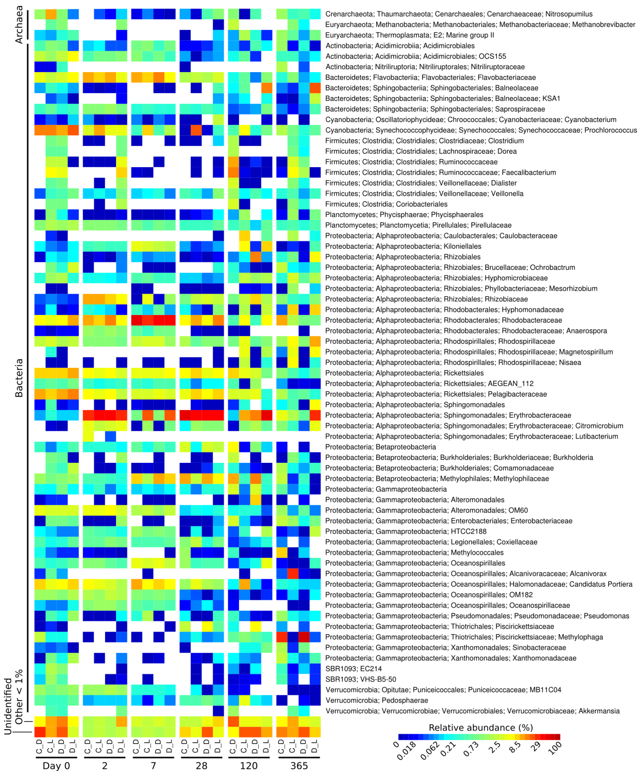
Figure 1 Heatmap showing the relative abundance of microbial genera over the one-year Cape Ferguson diuron incubations. The four incubation conditions are control + dark (C_D), control + light (C_L), diuron + dark (D_D) and diuron + light (D_L). The three replicates of each incubation condition were averaged and only microbial genera reaching 1% are indicated.