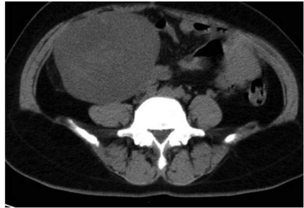
Figure 2. A pelvic mass examined by computed tomography (CT). CT examination revealed a well-defined mass in the posterior uterine region, which was considered fibroid steatosis.

The mass was removed and a quick-freezing examination was performed. The results indicated that it was a mesenchymal tumor and adenomatoid tumor was possible. We treated her with a total hysterectomy and bilateral adnexectomy. The final pathology of paraffin confirmed it as localized well-differentiated benign mesothelioma (Fig. 3A). The results of immunohistochemistry showed that the 3 molecules Calretinin, D2-40, CK were positive, while p53, EMA were negative (Table 2). The tiny neoplasm on the surface of the ovary was also thought to be mesothelioma involvement. In addition, a small nodule with a diameter of about 2 cm was found in the myometrium, and the pathological result suggested adenomatoid tumor (Fig. 3B).