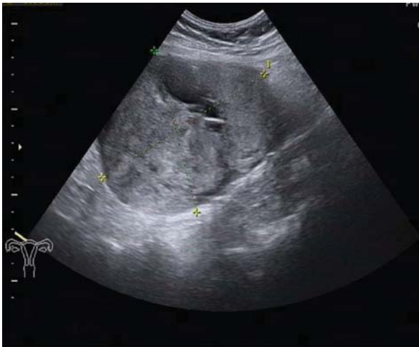
Figure 1. A pelvic mass examined by transvaginal ultrasound. Ultrasonography showed a 12 \times 11.4 \times 9.8 cm heterogeneous mass behind the uterus, with a cystic dark area of 3.4 \times 2.3 cm.

Intraoperative observations were described as below: There was a small amount of viscous fluid in the pelvic cavity. The uterus was enlarged to the size of 2 months gestation. There was a mass about 12 cm in diameter behind the uterus with a pedicle attached to the uterus. The mass was multilocular cystic with myxoid fluid. The surface of the left ovary was dotted with minute neoplasms. No obvious metastatic lesions were observed elsewhere.