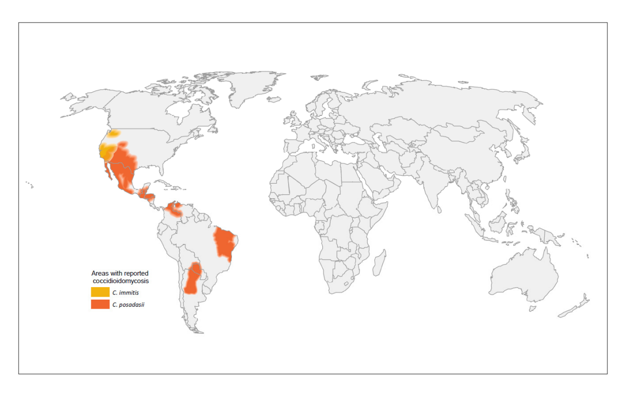
Figure 1. Global geographic distribution of the Coccidioides species.

The development of more rapid diagnostics is key to early and accurate diagnosis. Despite improvements in test offerings and performance over time, challenges to coccidioidomycosis diagnosis persist. Results can be difficult to interpret, and sensitivity and specificity may vary based on immunosuppression status and stage of disease. These complexities are compounded by low clinician awareness, particularly outside of known endemic regions [14,15]. Continued developments in antifungal therapy aim to improve patient outcomes and address concerns of toxicities, though questions regarding early treatment and optimal management persist.