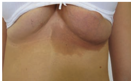
Figure 1. Hyperpigmented patch on a zosteriform distribution on the submammary region.

al. 6 that a different dermatosis can be expressed according to the cytokine pattern of the inflammatory response. Conversely, it is to be remembered that other conditions, such as zosteriform lichen planus, have been interpreted as a manifestation of Koebner's phenomenon. This pattern would be an expression of a viscerocutaneous reflex mechanism within the affected segments consequent to a radicular irritation caused by abnormalities in the spine. Nevertheless, further studies are needed to better interpret Wolf's isotopic response.