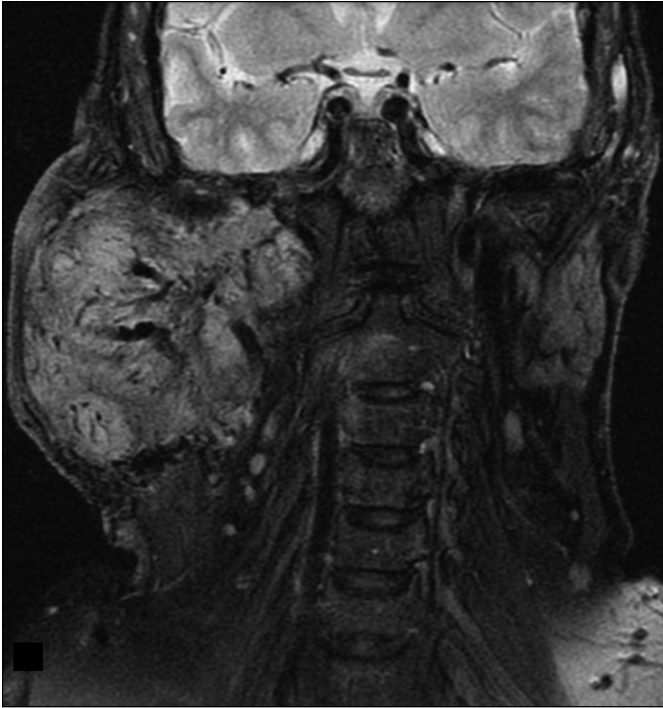
Figure 1. Magnetic resonance imaging of a 9-cm jugular paraganglioma invading the skull base, carotid vessels, and the mastoid part of the temporal bone.

normal bowel sounds without tenderness, distension, or masses. Laboratory studies showed anemia (9.4 g/dL), thrombocytosis (724,000 platelets/ \mu L), elevated erythrocyte sedimentation rate (120 mm), and hypoalbuminemia (2.7 g/dL). Alkaline phosphatase and gamma glutamyltransferase were slightly altered at 141 U/L and 100 U/L, respectively. 24-Hour urine collection showed 1.2 g/d proteinuria, with normal creatinine (1.16 mg/dL). Chest x-ray was normal.