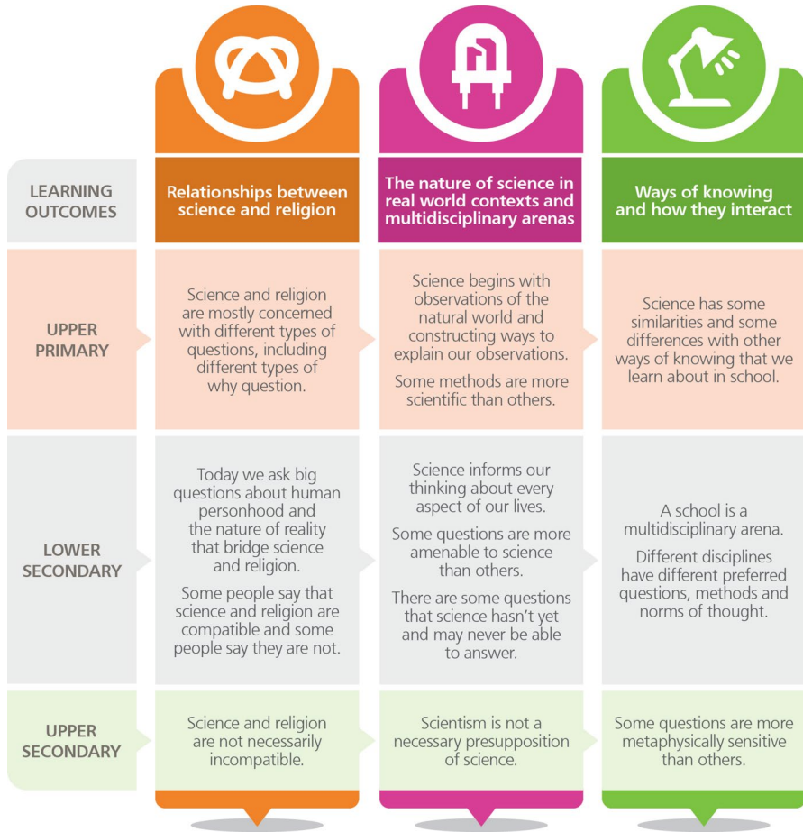
Fig. 1 Epistemic insight curriculum framework (Billingsley et al. 2018)

was based on convenience, suitable for a small-scale, exploratory study (Maxwell 2012).