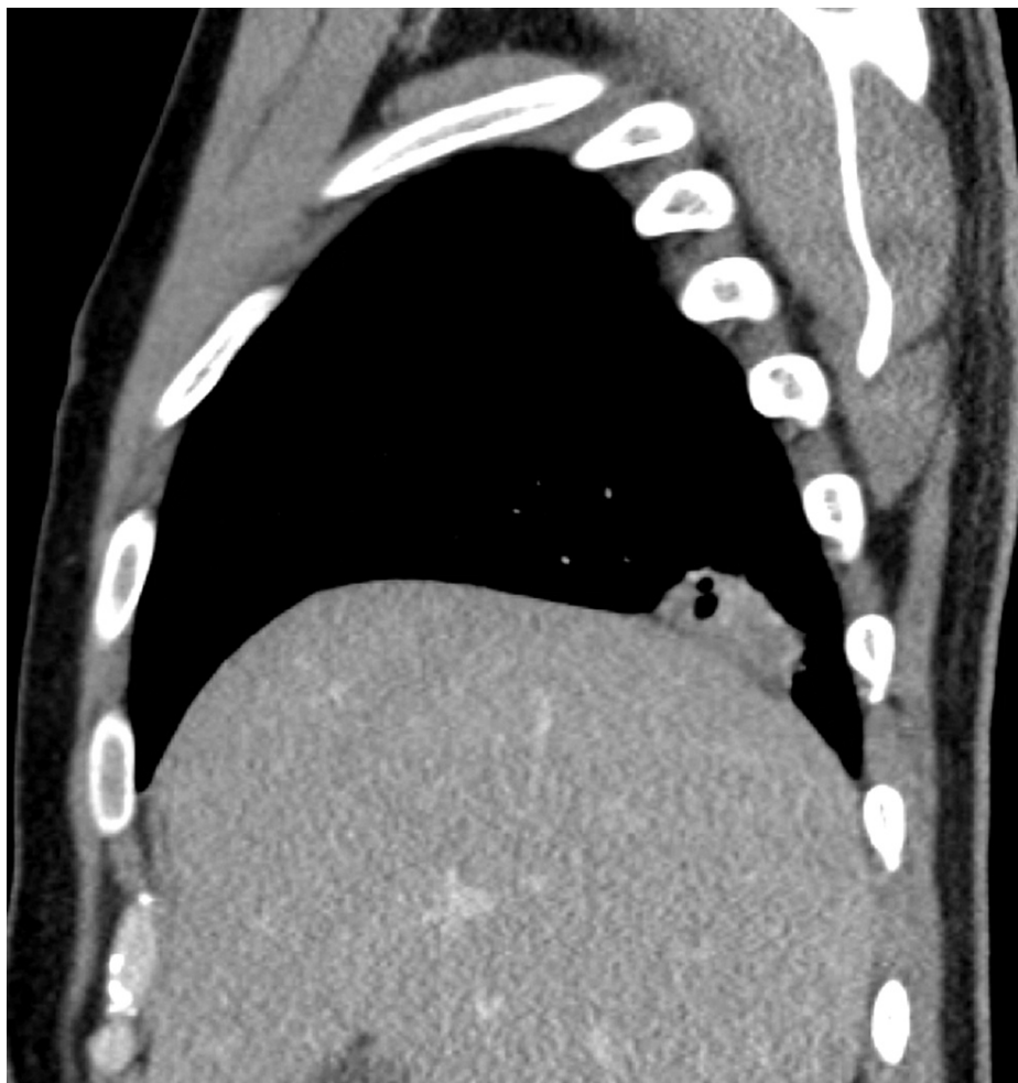
FIGURE 2: Computerized tomography of the chest with contrast, sagittal view, showed an irregular, pleural-based mass at the right lower lobe with small air foci.