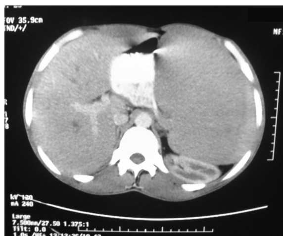
Figure 3: Computed tomography abdomen showing hepatosplenomegaly

of leukemia or as a site of leukemia relapse. [6] The incidence of GSs is rising due to early diagnosis, better chemotherapeutic