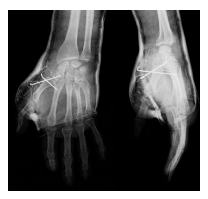
Fig. 4 Postoperative X-ray.