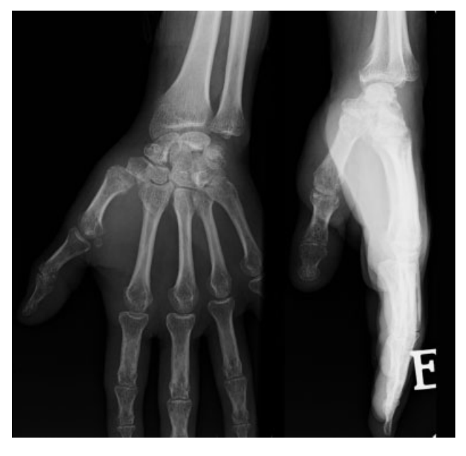
Fig. 5 Trapeziometacarpal subluxation at the 1- year follow-up.

Patel<sup>14</sup> said in 1983. Both patients discussed presented dorsal dislocation, but the authors could not specify which ligament was ruptured because they used closed treatment techniques.