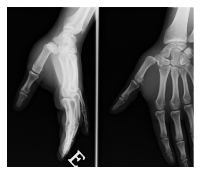
Fig. 1 Isolated carpometacarpal dislocation of the thumb.

The 6-months follow-up X-ray showed no signs of subluxation or articular degenerative changes (>Fig. 2).