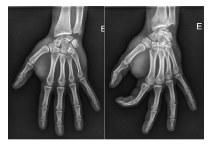
Fig. 2 Six-month follow-up.