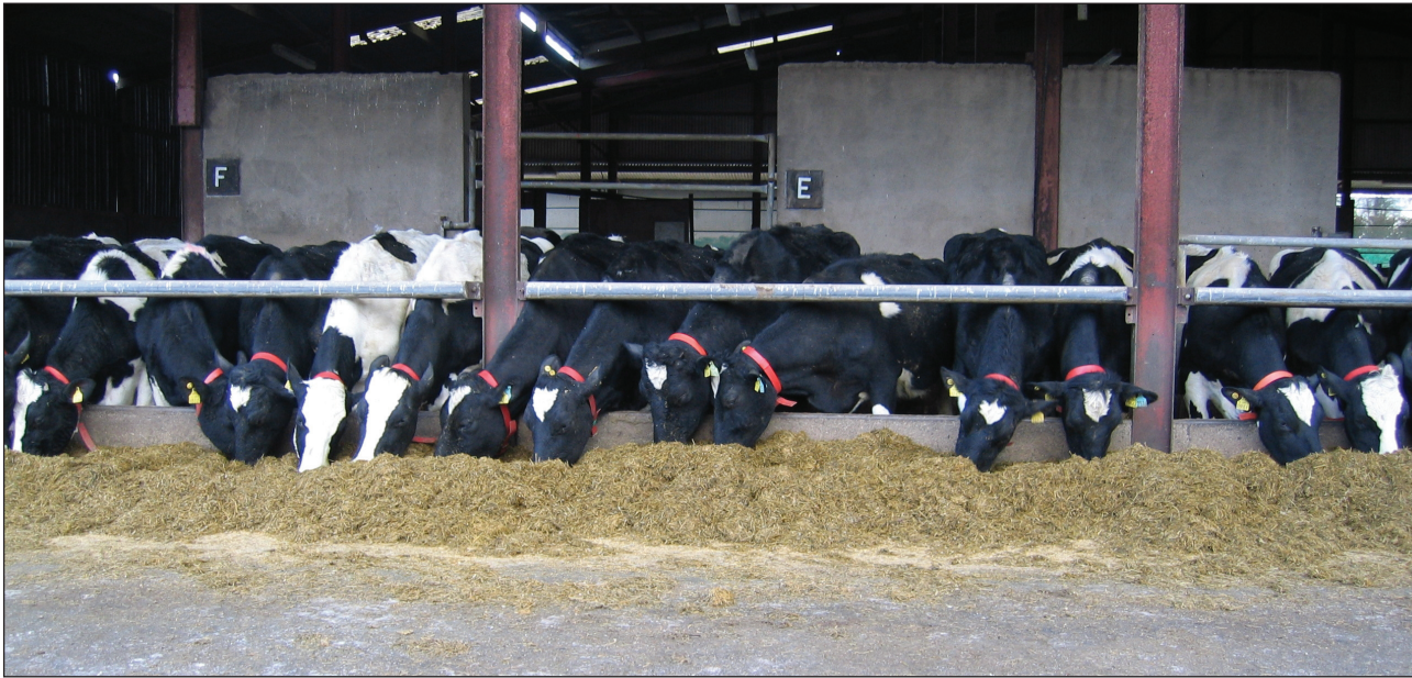
This study looked at the effect of restricting silage feeding on time of calving and calving performance in Holstein-Friesian cows.

regardless of feeding system. This reduction in nighttime calvings varied between two and 16 percentage units, by herd. The percentage of unassisted calvings did not differ between treatment groups ( P>0.05 ). Less calvings were recorded with slight assistance in the restricted group compared to the control group ( P<0.001 ). Cows with restricted silage access had a higher percentage of difficult calvings (11%) compared to the control cows (7%) ( P<0.001 ). Within the restricted group, there tended to be more dystocia during the day (12%) compared to the night (8%) ( P<0.10 ). In the control group, there was no difference in the dystocia rate between the day (7%) and the night (8%) ( P>0.05 ).