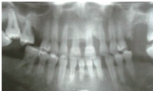
Figure 3. Panoramic radiograph of the same case in the previous figure (female, 21 years) showing alveolar bone levels, missing teeth, and the presence of alveolar bone defects.

Chronic periodontitis is a common disease and can occur in most age groups but is more common in adults and elders worldwide [15]. Its prevalence and severity increase with age [3,4,16]. Aggressive periodontitis is characterized by severe and rapid loss of periodontal attachment and may be more common in children and adolescents. In young individuals, the onset of these diseases is often circumpubertal. The pri-