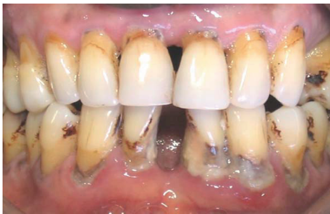
Figure 1. Buccal view of chronic periodontitis among male 45 years with no systemic disease or risk factors showing attachment loss and a significant amount of local factors.