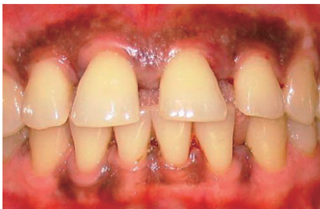
Figure 2. Buccal view of an aggressive periodontitis case in a 21-year-old female with no systemic disease or risk factors, showing discrete inflammation of the gingiva and very few local factors with the presence of diastema.

ease [11,12]. Although clinical attachment levels are considered the gold standard in periodontal diagnosis and outcome measurement, they do not reflect issues that may be important to patients. Quality of life issues such as pain and discomfort, changes in esthetics or function, costs of therapy, and tooth loss are seen by patients to be more relevant than attachment levels or probing depths [13,14]. Therefore, it must also be taken into consideration that functional impairment and psychosocial impact of periodontal diseases may reduce quality of life.