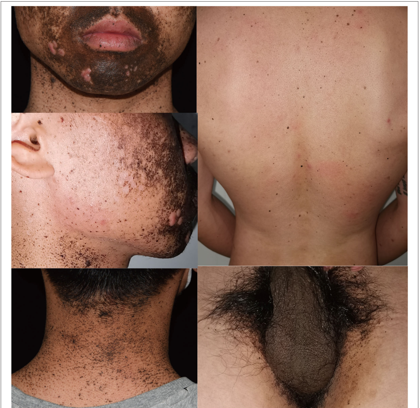
FIGURE 2 | Clinical presentation of the proband showing hyperpigmentation and multiple lentiginos on face, neck, back, and inguinal areas.

his body for 18 years. The patient had a family history that his father, grandfather, aunt, and cousin had similar symptoms ( Figure 1 ). He was otherwise healthy without abdominal pain or mass, dysphagia, and weight loss. The patient and his father underwent annual physical examination without abnormal routine blood and urine test, liver, and renal function test, and abdominal CT scans. His grandfather lived a healthy longevous life without any obvious systemic disorders. Physical examination revealed hyperpigmentation with a dark brown spot