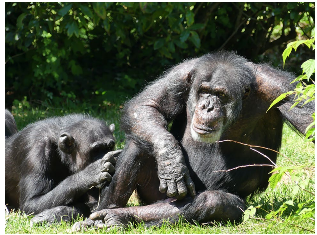
Fig. 1 A female chimpanzee grooms a male chimpanzee

Allogrooming events were recorded via instantaneous sampling (Altmann 1974). Every 15 min, the whole group was scanned and the individuals involved in allogrooming were recorded, specifying whether it was a mutual grooming event (i.e., the two partners groomed each other simultaneously) or a uni-directional grooming event (i.e., one individual groomed the partner, Fig. 1). We carried out 433 scans (mean \pm SD: 14.5 \pm 2.5 per day) during the control period and 329 ( 15.6 \pm 2.7 per day) during the restricted period. All instances of aggressive interactions (i.e., any behavior against another individual leading to screaming, or a bluff sequence leading to a submissive response or avoidance by another individual: van Hooff 1974) were recorded using all occurrence sampling (Altmann 1974) during 1-h observations 1–3 times a day. We are confident this sampling method was reliable because such aggressive interactions are conspicuous, being associated with loud vocalizations and occurred almost exclusively in a rather limited space: the indoor enclosure. We collected 51 h of all-occurrence