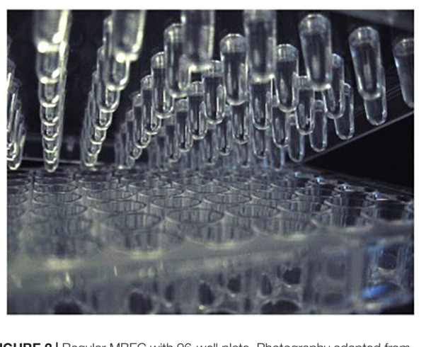
FIGURE 2 | Regular MBEC with 96-well plate. Photography adapted from Parker et al. (2014).

Besides, there is still no available standardized tool to detect easily the presence of sessile cells in a clinical sample and allow determination of their specific antibiotic susceptibility. As biofilm bacteria are inherently more tolerant to antimicrobials, the establishment of the corresponding breakpoints to predict therapeutic success is needed. New methods monitoring the effect/response of biofilm cells to antibiotic therapy must