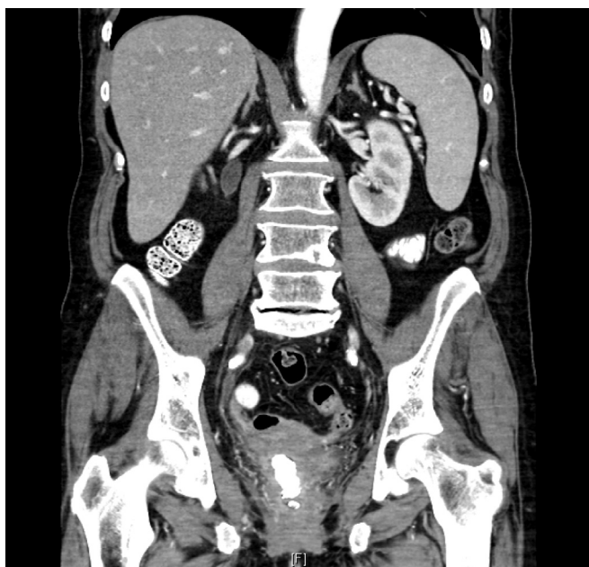
Fig. 2. CT, coronal section, showing linear radiopaque material in the vaginal canal with a smaller distal extension.

The Lippes Loop was the most widely prescribed IUD in 1962