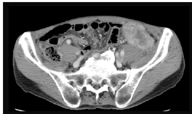
Figure 1 Sigmoid colon cancer invading to the retroperitoneum at the time of initial diagnosis.

It has been reported that NF has a high morbidity and mortality rate because of its acute and rapidly progressive course. The outcome of NF is rendered poor most importantly by delays in its diagnosis and surgical debridement. Thus, early diagnosis of necrotizing soft-tissue infections followed by administration of intravenous antibiotics and surgical intervention is the best way of decreasing the mortality associated with this aggressive infection. Clinical features of NF include high fever with chills, tender-