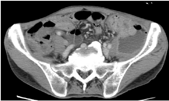
Figure 2 Retroperitoneal abscess adjacent to the sigmoid colon tumor.

ness over the affected area along with changes in skin color, and palpable crepitus[1].