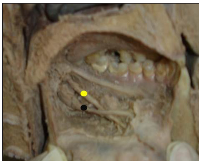
Figure 2. Image showing the intersection point between LN (yellow) and the submandibular gland duct (black).

and the mandibular plate, at the level of the third molar socket (Figure 3 and Table 1). This result was greater than that found by Pogrel et al. [12] (3.45 mm; SD 1.48 mm), by Behnia et al. [14] (2.06 mm; SD 1.1 mm) and by Hölzle and Wolff [13] (0.86 mm; SD 1 mm). Kiesselbach and Chamberlain [15] found a horizontal distance of 0.59 mm (SD 0.9 mm) between the LN and the mandibular lingual plate. Miloro et al. [16] found this same relationship with 2.53 mm (SD 1.48 mm). These distances are smaller than those found in the present study. This can be justified for the size of our sample, since in the Behnia et al. study [14] it involved 669 LNs in 430 corpses with a maximum of 24h post-mortem. Our specimens were conserved by immersion in 10% formaldehyde, with a time of immersion varying from 2 to 5 years, which might cause changes in the tissue volume of the analyzed parts.