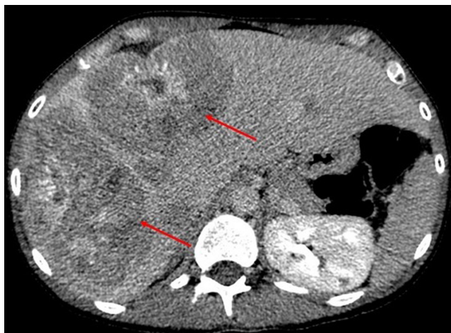
Figure 1 CT with contrast at diagnosis showing numerous hypodense metastases (red arrows) in the liver (patient 1).

Patient 2: A 30-year-old female experienced a self-limited episode of diarrhea at 25 weeks gestational age for which she was diagnosed with acute gastroenteritis. At 37 weeks, a cesarean section was performed due to arrest of descent during labor. At 2 weeks post-partum, she began experiencing copious diarrhea that was attributed to post-operative bowel changes. Treatment for Clostridium difficile with metronidazole and then oral vancomycin had little impact on her symptoms. Diarrhea persisted with more than ten loose stools per day and electrolyte derangements. A flexible sigmoidoscopy was performed after patient reported the passage of air and stool per vagina, which revealed an area of ulceration and nodularity in the upper rectum. Biopsies confirmed invasive adenocarcinoma. At the time of her diagnosis, she had lost 30 pounds from her pre-pregnancy weight, was incontinent of feces and had developed a rectovaginal fistula. Magnetic resonance imaging of the pelvis at diagnosis revealed a bulky infiltrative high rectal mass extending into the right pelvic sidewall, with direct invasion into the fundus of the uterus and fistulization into the endometrial canal (Fig. 2). A staging PET/CT demonstrated no evidence of metastatic disease; however, peritoneal carcinomatosis was discovered during a laparoscopic diversion procedure.