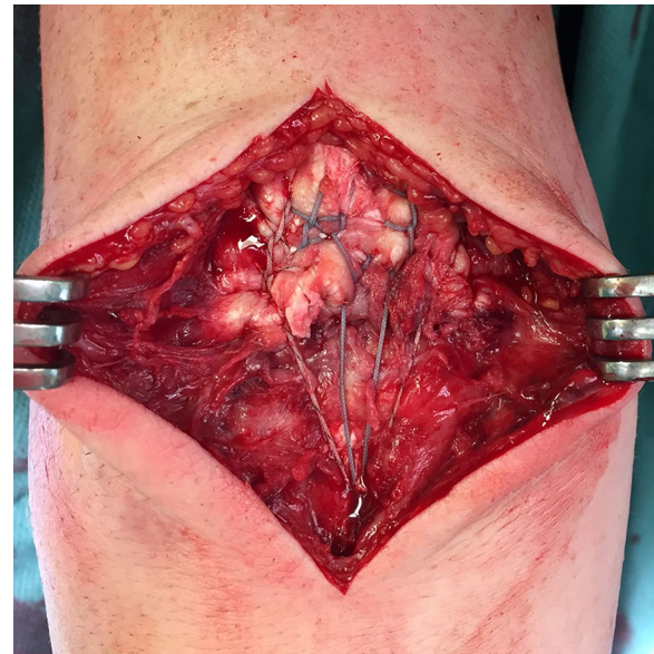
Fig. 1 Intraoperative situs of the V-shaped technique: the unicortical fixation using a BicepsButton™ provides a planar contact pressure of the triceps tendon

In the next step, the V-shaped double-row fixation was performed using the unicortical button fixation technique analogous to the previously described distal biceps tendon repair [18]. Four centimetre distal to the distal footprint line, a 3.2-mm drill-hole was centrally drilled into the posterior cortex of the ulna at an angle of 45° (with proximal direction) related to the ulnar shaft. The cancellous bone within the intramedullary canal was then compressed using a small clamp to create space for the BicepsButton™ (Bicepsbutton, Arthrex Inc., Naples, FL, USA) implantation. Next, the button was loaded with all four FibreWire sutures (in reversed fashion), passed through the posterior cortex and flipped intramedullary (Fig. 1). Due to this V-shaped suture configuration, the distal tendon stump was planar pressed to its insertion. Each suture was strongly tightened after flipping the button to compress cancellous bone at the intramedullary