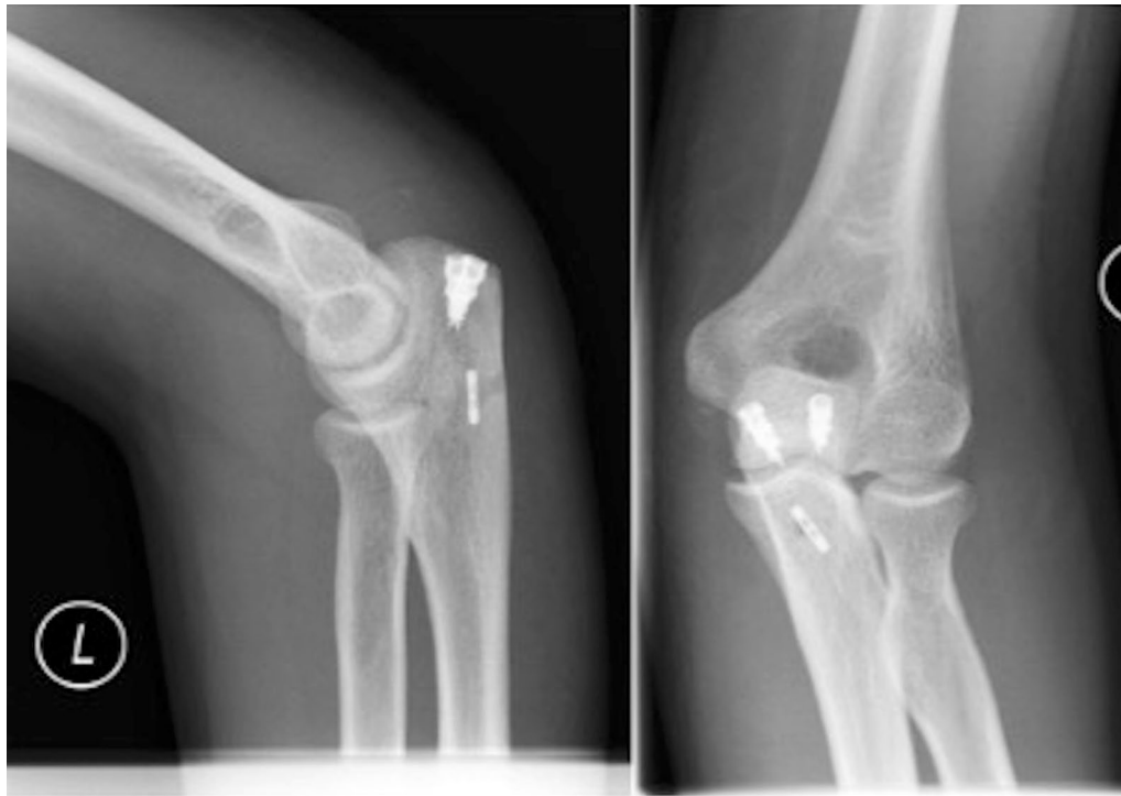
Fig. 4 Postoperative radiograph showing the intramedullary cortical button

anchors were used in the present case; however, bioabsorbable suture anchors would be a potential alternative for proximal row fixation.