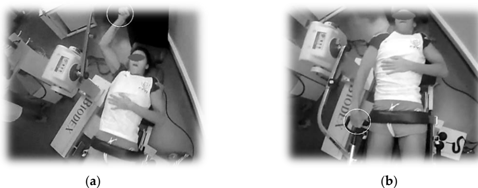
Figure 1. Initial and final positioning of the hand (white circle) during upper limb simulated action isokinetic test ((a) and (b) panels, respectively).

In isokinetic dynamometer (Biodex System 4-Biodex Medical Systems, Inc., Carrollton, TX, USA), after freely warmed-up without constraint of velocity, swimmers performed a shoulder and knee extension/flexion (representing the front crawl and backstroke upper limb action with 180° range of motion and leg movement during the lower limb actions with 90° range of motion, respectively) at 90 and 300°/s and a sampling rate of 100 Hz. These angular velocities represented a low (used for construct ratios of forces in a clinical point-of-view) and a high (similar to competitive swimming). Swimmers were positioned in the dynamometer chair with a forearm supination similar to hand positioning during swimming (Figure 1). The tests consisted in five sub-maximal repetitions at each pre-defined angular velocity, 10 maximal repetitions with 90 s and 10 min of rest permitted between side trials and movements, respectively. Swimmers were instructed to generate maximal one-way force during the phase of knee and shoulder extension to form a more realistic simulation of the aquatic environment motion.