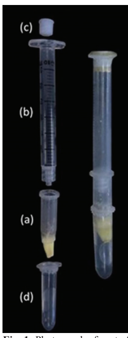
Fig. 1: Photograph of part of the device developed for the glucose leakage test. (a) 1.5 mL Eppendorf tube with the root segment; (b) syringe; (c) screwed device; (d) 2.0 mL Eppendorf containing deionized water.