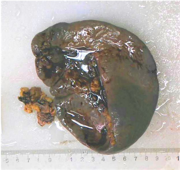
Figure 3: The postoperative pathology report confirmed the diagnosis of a true splenic artery aneurysm.

for rupture of the aneurysms are confirmed, which include pregnancy, a diameter greater than 2 cm, portal hypertension, development of symptoms, and liver transplantation et al. [10,11].