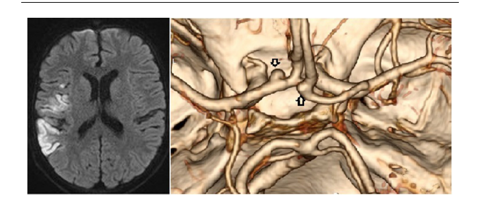
Fig. 2. At the age of 14 years, after the stroke, brain CTA (right) showed an aneurysm in the left anterior cerebral artery with a largest diameter of 8 mm and smaller aneurysm of 2 mm in diameter in the right anterior cerebral artery (indicated by arrows). Two other small aneurysms are not presented in this figure. Brain MRI with diffusion weighted sequence (left) demonstrated an acute right temporal infarct.

At the age of 12, when the lymphocytic meningitis caused by B. burgdorferi was diagnosed, several diagnostic tests were performed. No herpes simplex virus, varicella zoster virus, enterovirus or human herpesvirus 6 were detected by PCR in the CSF. No serum IgM or IgG antibodies against tick-borne encephalitis virus, cytomegalovirus or Toxo plasma gondii were found. No CSF IgM or IgG antibodies against cytomegalovirus, Toxoplasma gondii or measles virus were detected. There were IgG but not IgM antibodies