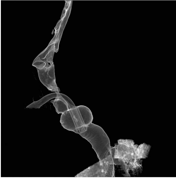
FIGURE 2. Three-dimensional computed tomography scan demonstrates that the shape and diameter of tracheal dilatation are exactly similar to those of tracheotomy tube cuff.