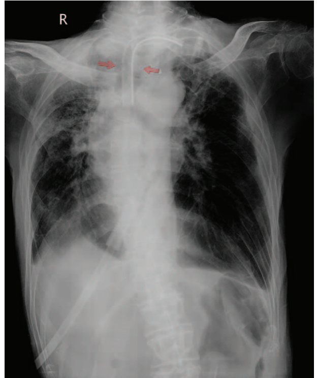
FIGURE 3. Anteroposterior radiograph of the chest shows decrease in tracheomegaly after using the adjustable tracheotomy tube (arrows).