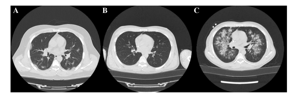
Fig. 1 Thoracic computed tomography images of Case 1. A Diagnosis of COVID-19 was established based upon peripheral and mainly posteriorly located GGOs. B After favipiravir treatment, lung findings such as GGOs regressed. C On the thoracic CT after the patient had