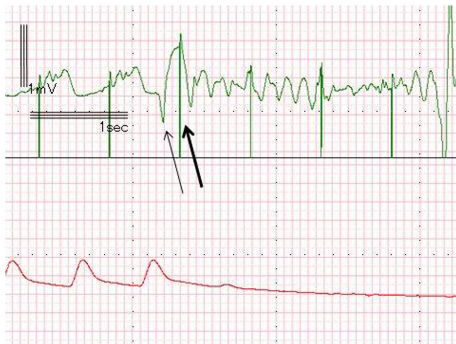
Fig. 4 ECG and pressure waveform during the second episode of ventricular fibrillation. This ECG also shows the R-on-T phenomenon resulting from undersensing of a PVC. A pacing spike hit the T wave (large arrow) following a PVC (small arrow) in this episode, as well

obtained values within the allowable ranges: Na, 144 mEq/L; K, 4.6 mEq/L; Cl, 117 mEq/L; and standard base excess, -3.8 mmol/L.