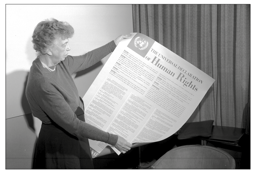
Figure 2: Eleanor Roosevelt, UN commission on Human Rights chair from 1946–52, commemorating the 1948 adoption of the Universal Declaration of Human Rights

Despite the early promise of human rights in advancing health, the Cold War presented formidable political obstacles. The Cold War superpowers (USA and Soviet Union) held sharply divergent positions on human rights, with the Western states embracing civil and political rights and the Soviet Bloc favouring economic and social rights. The comprehensive vision of