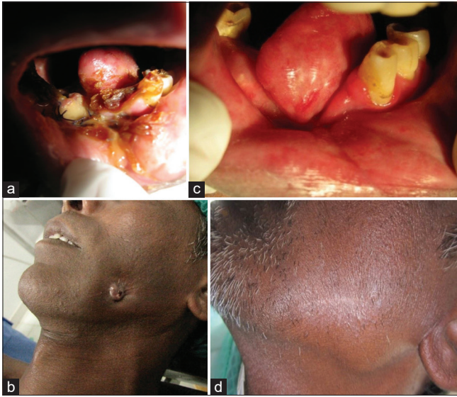
Figure 1: Illustrative clinical outcome of one of the included cases. (a) Pre-operative clinical image of necrosis of the mandible post-irradiation, (b) Pre-operative presence of extraoral sinus tract, (c) Post-operative outcome at 6 months of OTE regimen; and, (d) Post-operative healed extraoral sinus tract by 6 months

24 months. All the cases reported an enhanced epithelisation of intra- and extra-oral lesions following radiation. Out of six cases, four cases were treated with DPSCs + BMAC + PRP with \beta -TCP and two cases were treated with DPSCs + BMAC + PRP with HA and we found no statistical difference in both the cocktail used for the management of ORN. The details of carcinoma and dose of radiation given for each case are depicted in Table 1a. The final clinical outcome observed at the end of long-term follow-up is described in Table 1b.