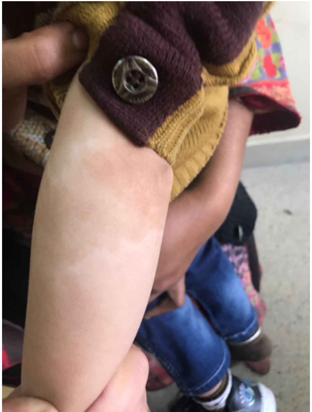
FIGURE 1: Photograph showing the depigmented patches on the left forearm. (Consent was obtained to publish this image).