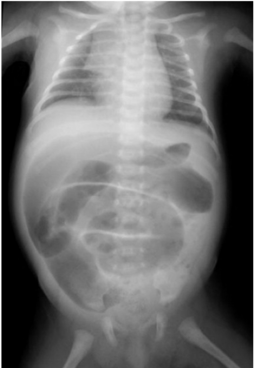
FIGURE 3: Abdominal plain X-ray shows a generalized distention of the loops of the large intestine. Typical findings of Hirschsprung disease were seen. (Consent was obtained to publish this radiograph).

To evaluate the hearing deficit, an auditory brainstem response was done, which showed a bilateral sensorineural hearing loss. The patient also demonstrated complete mutism and lack