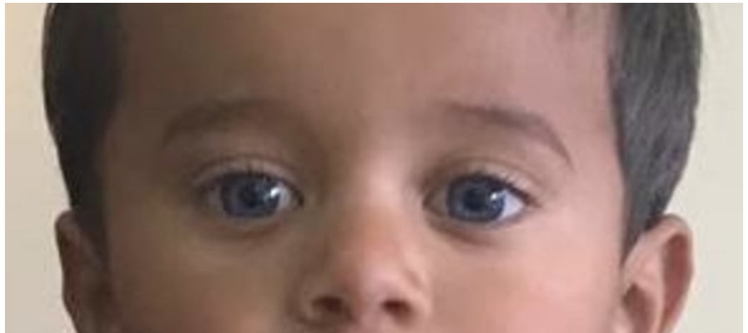
FIGURE 2: Photograph of the case showing a blue-colored iris bilaterally. Homochromatic irises are not discussed in the literature, although heterochromia is a hallmark of Waardenburg syndrome and its subtypes. (Consent was obtained to publish this image).

The patient's mother reported the presence of a white hair patch (poliosis) in the frontal hair distribution since birth, which diminished upon cutting the hair. A delay in achieving multiple milestones, including neck holding, crawling, sitting, and walking were also reported. The mother had an uneventful natal history with two healthy daughters without the presence of any similar symptoms in them.