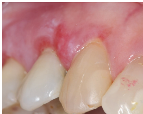
FIGURE 1: Gingival OLP: a mixed red and white lesion in the background of white striations involving the gingiva between teeth 13 and 14. No to minimal plaque is noted and the involvement of the attached gingiva distinguishes OLP from plaque-induced gingivitis.