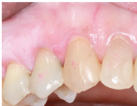
FIGURE 4: Resolution of erythema and active gingival inflammation due to OLP lesion involving the gingiva between teeth 13 and 14 following use of topical corticosteroid ointment.

topical corticosteroid ointment three times daily for two weeks applied directly to the lesion. Specifically, betamethasone valerate 0.05% was used as a topical application to the affected areas. Successful resolution of background erythema and active gingival inflammation was noted in the review appointment (Figure 4). Other areas involving the oral cavity such as the left buccal mucosa improved significantly. From a periodontal perspective, the most important part of the therapeutic regimen is treatment of periodontal disease (conservative nonsurgical approach), an atraumatic oral hygiene in terms of gentle tooth brushing and flossing using spongy type floss. Evidence of the literature supports this statement in the context of personalized plaque control for OLP gingival manifestations [14]. This will in turn result in significant improvement in a large number of patients. Effective plaque removal without traumatic influence on the gingival tissues must be established. In case of persistent pain typically associated with ulcerative and atrophic types, antifungal treatment may be necessary if the lesion contains candida species [8]. In chronic and symptomatic OLP cases, the response to the above treatment regimens is usually poor; therefore, topical corticosteroids are considered the first-line medications to control patients' symptoms. However, relapse in such cases is very common and intermittent episodes of treatment may be required over an extended period of time.