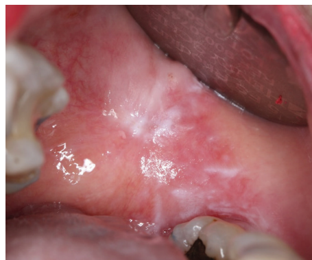
FIGURE 2: Left buccal mucosa: predominantly white plaque-type lesion and white striations noted in the background of mild erythema.

diseases clinically as well as histopathologically [9]. With that being said, most oral lichenoid lesions are directly presented adjacent to direct restorative materials such as amalgam and composite [9]. Further understanding and clinical experience aids in implementing a long-term management plan for OLP cases.