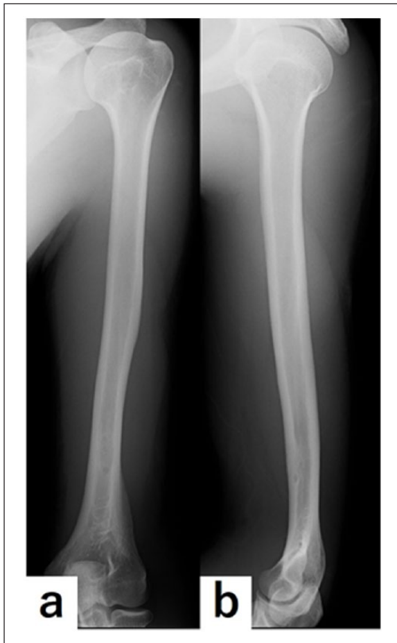
Figure 2. Plain radiograph of the humerus in 7 years after operation: Plain radiograph of (a) anteroposterior view and (b) lateral view shows no osteolytic lesion that shows recurrence.

extremely rare. 1,5,9 The ulna, radius, clavicle, and humerus have been reported as unusual locations for OFD. 5,9-11 Wang et al. 9 reported cases of OFD arising in the ulna in a 7-year-old patient and in the radius in an 18-year-old patient. Ozaki et al. 10 reported a case of OFD in which lesions were observed in the bilateral tibia and ulna and the right fibula. Gopinathan et al. 11 reported a case of OFD arising in the clavicle. To the best of our knowledge, there are only three previous reports of OFD arising in the humerus (Table 1). 6-8 In all cases, the tumor occurred in the diaphysis of the humerus in a teenager. Treatment methods