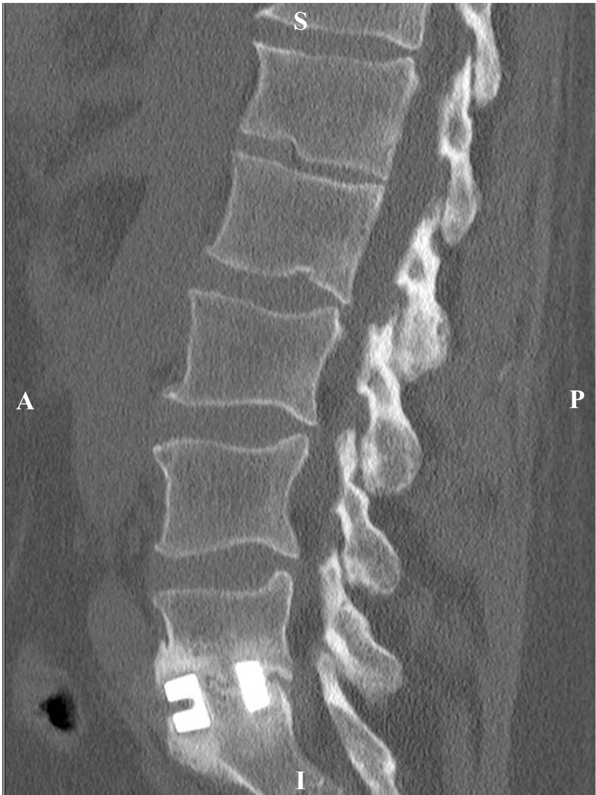
Fig. 3. Case 1: Contrasted nine-month post-op CT image showed successful fusion without migration of the \text{Si}_3\text{N}_4 interbody spacer.

a brace immediately after surgery and completed intravenous and oral antibiotic therapy at home. At five months after surgery, he had returned to work with relief of pain, and was also free of any analgesic medications. Lumbar X-rays were taken at seven months