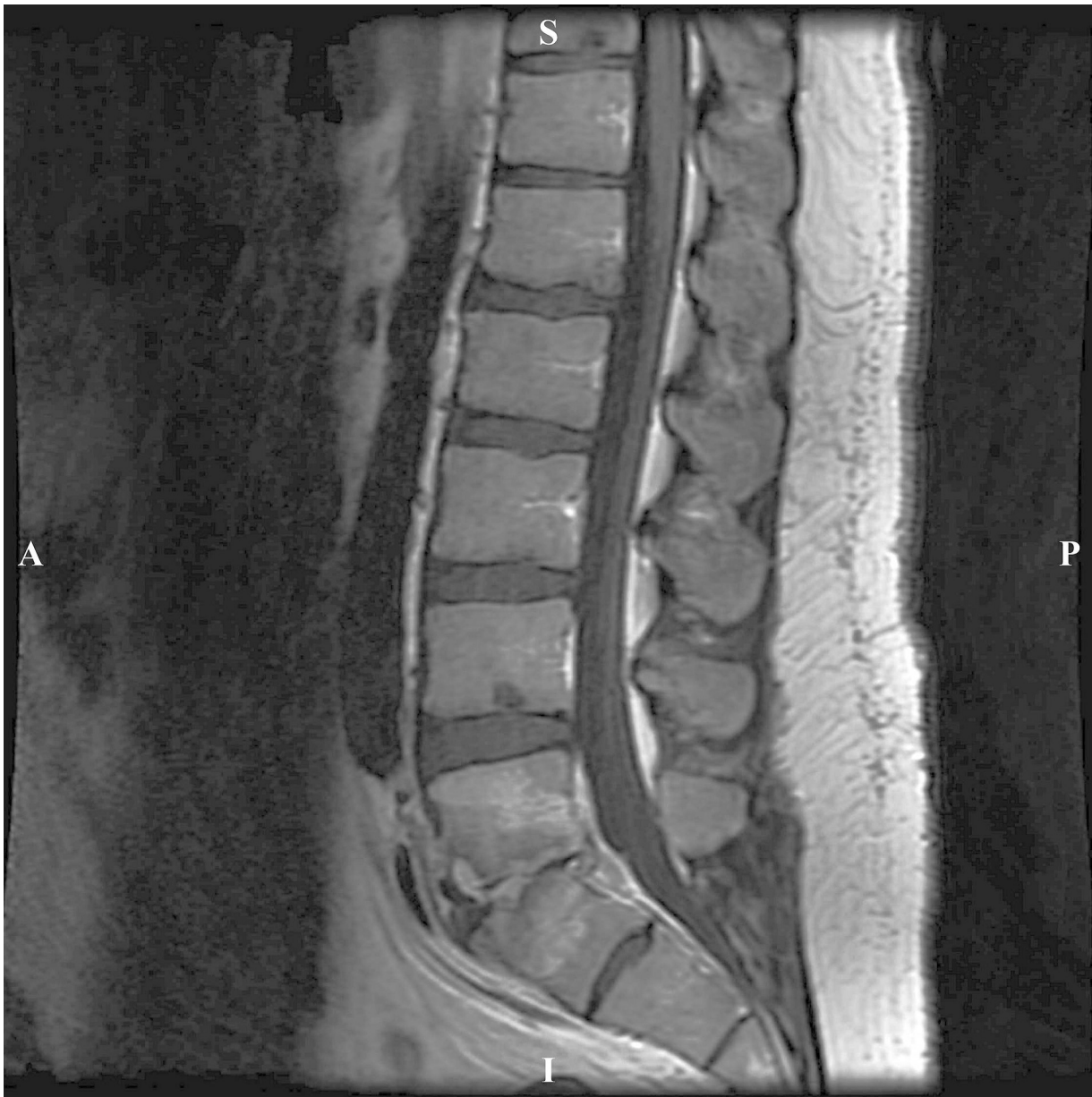
Fig. 4. Case 2: Contrasted pre-op MRI showed contrast enhancement within the L5-S1 disc space, with advanced disc space collapse and vertebral body edema, consistent with discitis.

CT scan evaluation confirmed successful interbody fusion without implant migration (cf., Fig. 3).