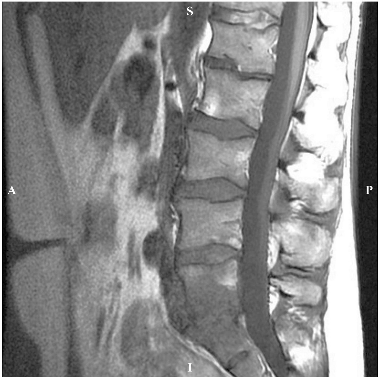
Fig. 1. Case 1: Non-contrasted pre-op MRI showed marked disc degeneration and adjacent vertebral body inflammation at L5-S1, consistent with discitis.

significant abscesses to form [3]. Conversely, magnetic resonance imaging (MRI) is the preferred modality for early radiological diagnosis [2]. It is the most sensitive (93–96%) and specific (92.5–97%) secondary imaging method for detection of discitis [4]. Without an appropriate MRI diagnosis and subsequent treatments, serious complications can ensue including vertebral abscess, osteomyelitis, meningitis, disabling deformities, neurological defects, and death [7].