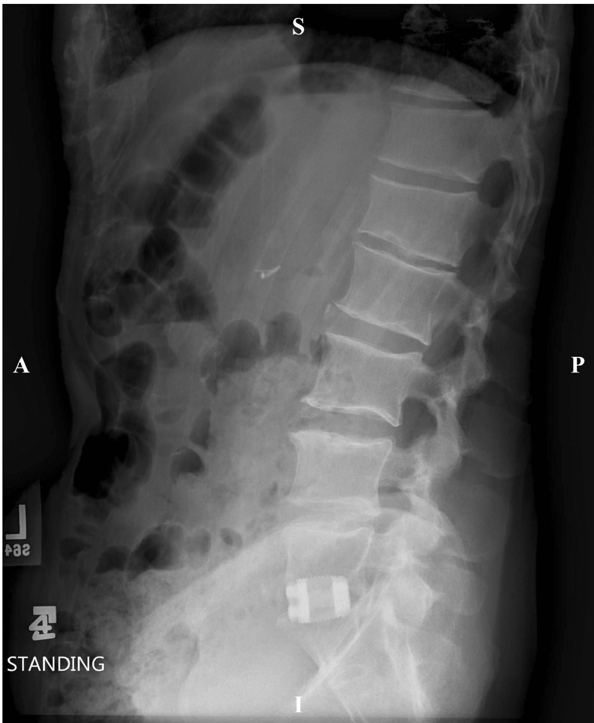
Fig. 2. Case 1: Seven-month post-operative lateral X-ray image showed stabilization of the fused segments obtained by the \text{Si}_3\text{N}_4 interbody spacer without instrumentation. Note the radiographic visibility of the implant on this view.

Plain X-rays were unremarkable, but an MRI scan showed discitis at L5-S1 without abscess formation (cf., Fig. 1). In addition to appropriate antibiotic therapy, the patient underwent anterior disc space debridement, with press-fit insertion of a silicon nitride spinal spacer (Valeo™-AL, 17 mm height 4° lordosis, Amedica Corporation, Salt Lake City, UT, USA). Morselized allograft was packed into the spacer lumen with one gram of vancomycin powder added to the graft material and placed directly in the disc space. While intra-