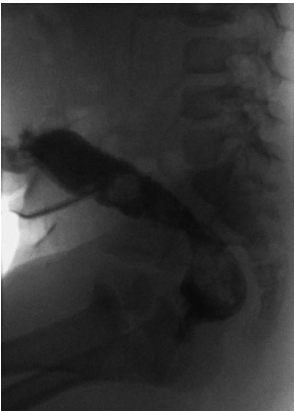
Fig. 1 Distal colostogram following failed posterior sagittal anorectoplasty for rectovestibular fistula.

The patient was allowed a period of several months to recover from the initial operation and diverting colostomy. Nutritional support was necessary to treat failure to thrive. Once healthy, a distal colostogram was performed to better understand the anatomy of the mucus fistula and retracted anoplasty. This was done in a manner similar to that of a standard work-up for a high male ARM (→Fig. 1). While no marker was placed at the site of the neoanus, the colostogram resembled a high lesion in a male with ARM. The patient was taken to the intraoperative MROR suite (IMRIS) equipped with a 1.5T Magnetom Espree magnet (Siemens, Erlangen, Germany). She was positioned in the supine position with legs suspended using the previously described suspension system. 10 A muscle stimulator was used to identify and mark