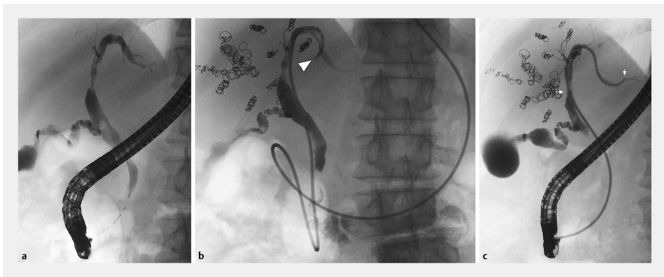
► Fig. 3 Endoscopic nasobiliary drainage (ENBD) for perihilar cholangiocarcinoma. a The endoscopic retrograde cholangiography findings showed a Bismuth-Corlette type IIIa perihilar cholangiocarcinoma. Because the optimal surgical plan involved a right trisectionectomy, a conventional 7-Fr ENBD catheter was inserted into the left lateral sectional bile duct. b After 20 days, the amount of bile flow from the ENBD catheter was decreased. Cholangiography via the ENBD catheter showed that the catheter tip was impacted in the thin side branch (arrow head). c A modified 6-Fr ENBD catheter was inserted upstream of the bile duct so that all of the side holes were upstream of the stricture site (arrows).

ENBD, endoscopic nasobiliary drainage; c-ENBD, conventional ENBD catheter; m-ENBD, modified ENBD catheter; EBS, endoscopic biliary stenting; EST, endoscopic sphincterotomy