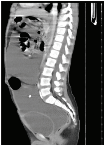
Figure 2: Sagittal section of abdominopelvic region showing a large simple cyst that filled whole of the abdominopelvic cavity and causing abdominal distension